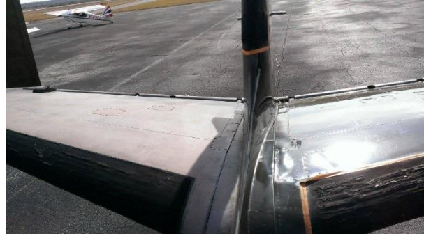
BEFORE & AFTER RESTORATION